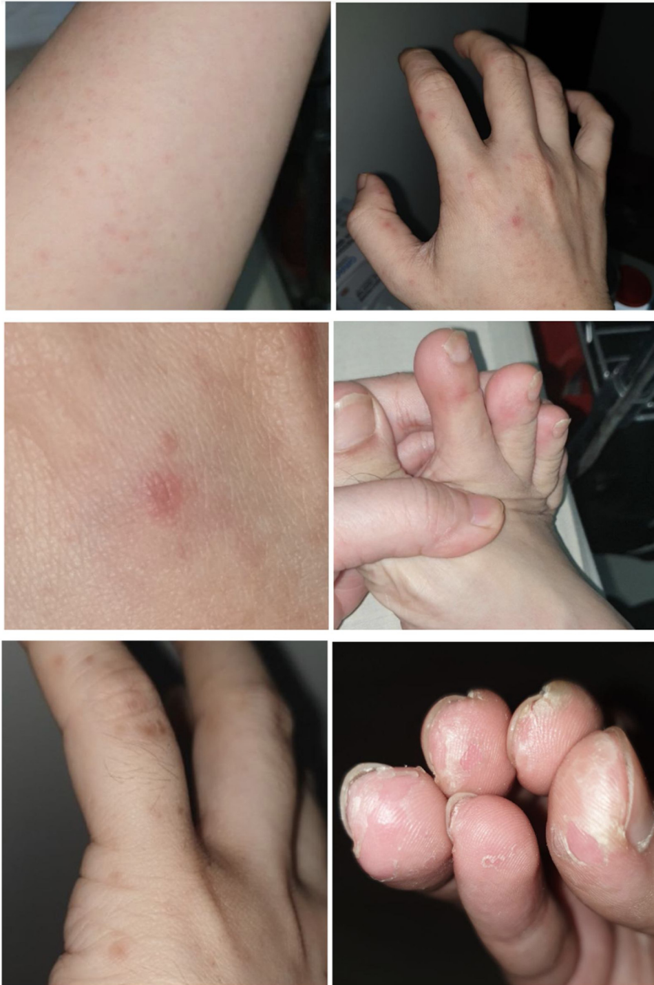
Figure 2. Viral Exanthem Manifestations. Upper and middle row: Distribution of Discrete Lenticular Lesions in Extremities on days three to five; Bottom row showing resolution of lesions on day seven with exfoliation of skin in fingertips on day fourteen.

Aside from due to drug eruption, viral exanthem distributed in the extremities area was at first thought to be the manifestation of hand, foot, and mouth disease (HFMD). The appearance of stomatitis aphthous also supported a diagnosis of HFMD (Knöpfel et al., 2019). However, there are several characteristics of HFMD which did not fit our patient: first, the most common age-group of HFMD was among