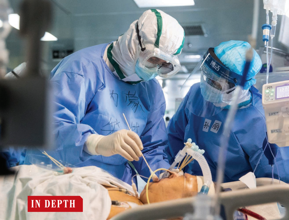
Medical staff treat a patient with the novel coronavirus this month in Wuhan, China.